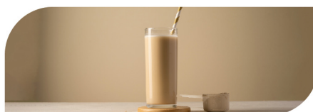
Beverages and powders