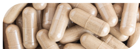
Tablets and capsules