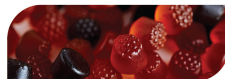
Gummies and chews

These statements have not been evaluated by the Food and Drug Administration. This product is not intended to diagnose, treat, cure or prevent any disease.