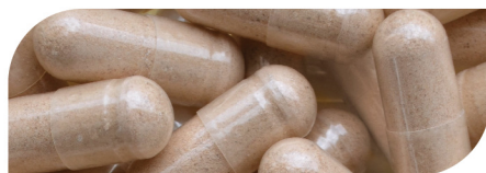
Tablets and capsules