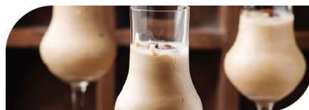
Beverages and powders